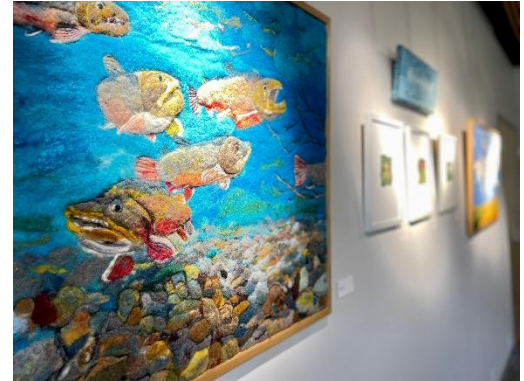
Mingling with Nature Exhibit – Textile Surface Design Guild