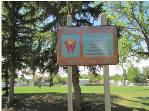
The Westminster School Community Play area sign, 2013.

The outdoor pool is located on the north side of the centre. There are bleachers to the east and grassy areas for sunbathing. The Westminster playground was part of the City of Lethbridge Community Facilities