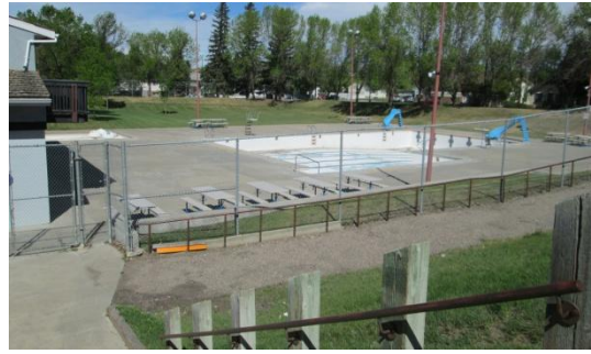
The outdoor pool at the Community Centre, 2013.