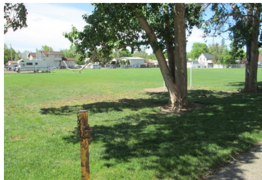
The Westminster School Community Play area open space, 2013.

The Westminster School Community Play Area is to the south of the playground. It is an open space adjoining baseball diamonds and sports field. There are tennis courts for for the public's use on the north side of the school.