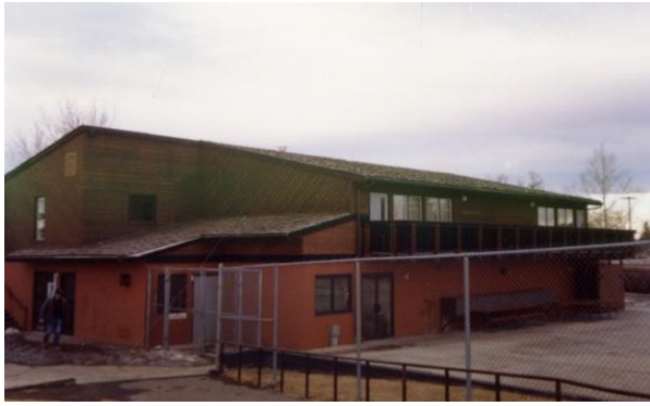
Westminster Community Centre facing 15 th Avenue North, 1991.