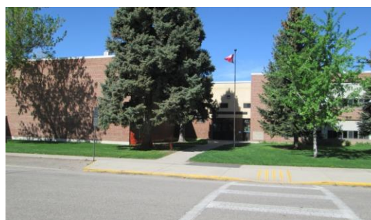
Westminster School built ca 1967 on 18 Street North; 2013.

This north side park occupies 3.59 acres bordered by 16 th and 18 th Streets and 3A and 5 th Avenues North, and was developed in 1949. It is home to the Westminster School, Pool and Community Centre. The school is located on the south end of the area on 18 th Street. This is the new Westminster School, not to be confused with the first Westminster School (1905-1968), built on 13 th Street and 5 th Avenue North.