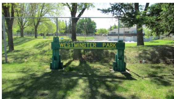
Westminster Park sign, 2013.