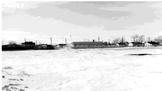
The Lions Playground with swimming pool at right. Skating and hockey rink at the left, 1951.

The name was for the Westminister District in London, England by William Lehman Ashmead Bartlett Burdett- Coutts, husband of Baroness Angela Burdett-Coutts.