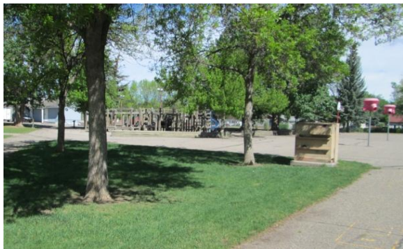
View of the Westminster Playground, 2013.

Enhancement Project in 1990 when new equipment was purchased and the playground was updated.