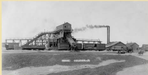
Royal View Collieries located north of Hardieville.