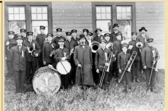
The Lethbridge Miners' Band. Entertainment and relaxation for miners.

The new Royal View Mine (Mine 1219) was operated as a co-operative from June 1937 to 1942. The Lethbridge Social Credit Co-operative Miners' Association Ltd. was made up of unemployed miners. The miners had all the necessary skills to operate a mine and received financial assistance ($10,000) from the Alberta government. They also received assurance they could stay on "Relief" (Social Assistance) until the mine began to turn a profit. Shares with a face value of $10.00 each were sold to investors but never returned a dividend. Social Credit was dropped from the corporate name in 1937 because of political opposition. After mines at Commerce and Diamond City were abandoned, some of the timbers ended up in the hands of the Lethbridge Miners Co-op.