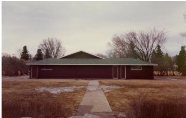
The multifunctional building

To the right of the entrance as one is facing south, there is a small playground and circular pathways wind through the green. In the vicinity of the maintenance shed and washrooms, there are to metal tables with checker boards for a friendly game of checkers in the summertime. Along the pathways straight and arched there are benches for one to relax. The various sized trees and shrubs enhance the area.