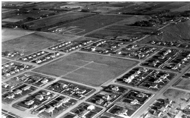
Aerial view of Victoria Park

The 6.92 acres park is located between 10 A. & 11 Avenue, and 14 th & 16 Streets and surrounded by residential area on all sides. After the Agricultural Society relocated to where the Exhibition Grounds are today, the former site was subdivided and auctioned off for residential lots.