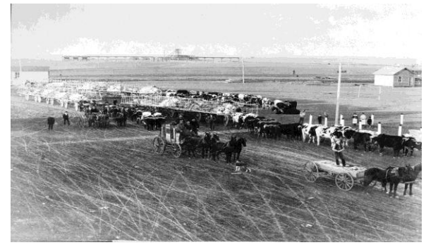
Bull trains turn around

This is the oldest parks in the city located in the downtown core and it was first known as The Square. Other names were Public Square, changed to Galt Park in 1909 and finally Galt Gardens, in 1913 and the present designation of Galt Gardens Park. The park commemorates the Galt Family, Elliot [1850-1928] and his father Alexander, one of the fathers of Confederation [1817-1893] who were an intrical part instrumental in developing Lethbridge in 1885 through the coal resources found nearby. The Galt Company Alberta Railway & Irrigation Company owned much of the land and Elliot set aside the area in 1885 for what he called "a breathing space for the town". The area was used for many years as a turning-around place for bull trains. In 1909 Elliot Galt donated a portion of that 10-acre to the city. The Galts retained a 200x200foot square in the centre referred to as the 'Reserve' which was deeded to the city in 1926 by the CPR who held title.