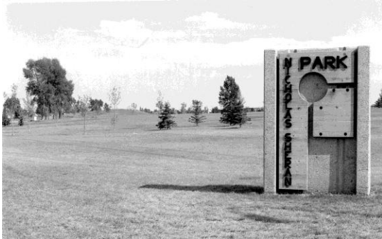
Entrance sign to park