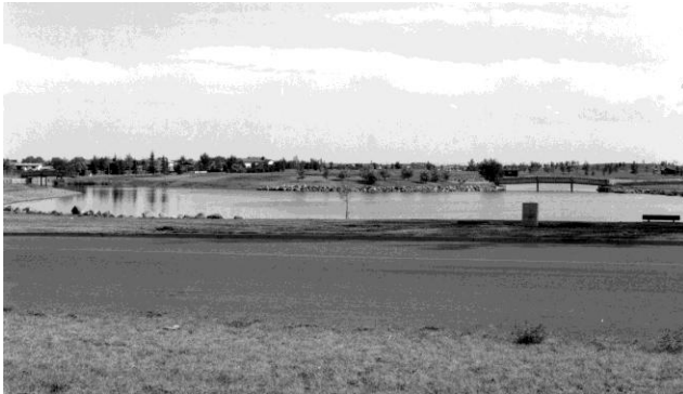
Nicholas Sheran Lake

The man-made lake is at centre of the park with pathways both asphalt and red shale circling it, leading to and from the lake and throughout the park and up the hill at the south end.