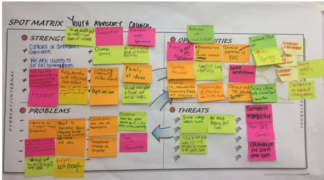
Figure 4: SPOT Matrix Map

The SPOT Matrix exercise was conducted to assess the Strengths, Problems, Opportunities and Threats in the areas that YAC operates. These four categories help to build an identifiable map to where YAC is currently achieving its mandate, where YAC could be attaining more success, and where YAC needs to work on improving its advocacy role.