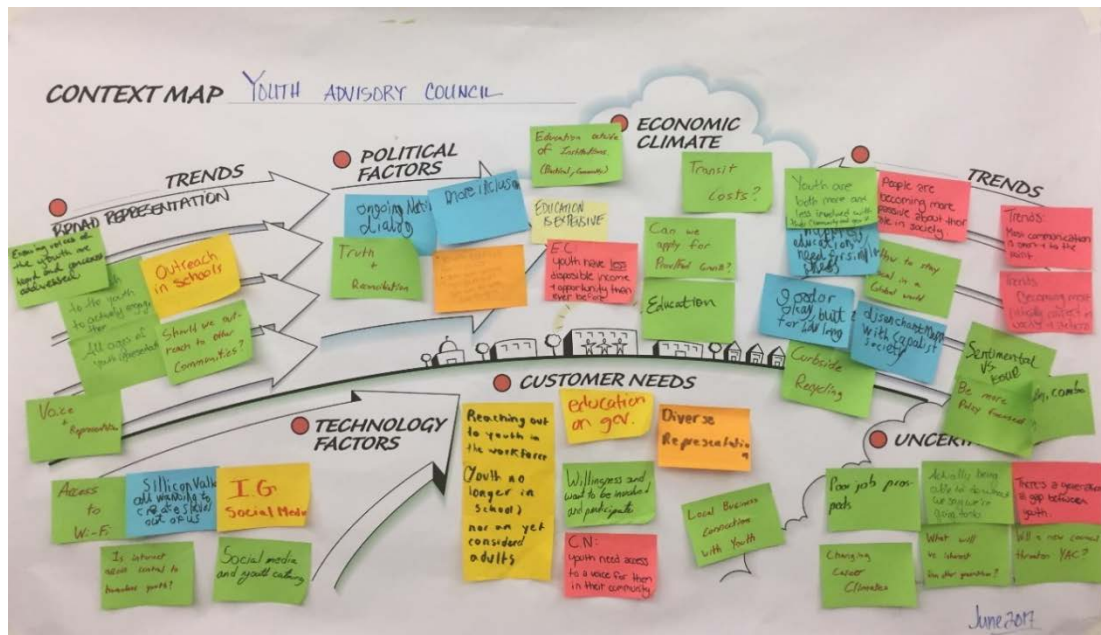
Figure 3: Context Map

The process of creating a context map is to identify the many different factors and issues that influence how youth in the community are portrayed and supported.