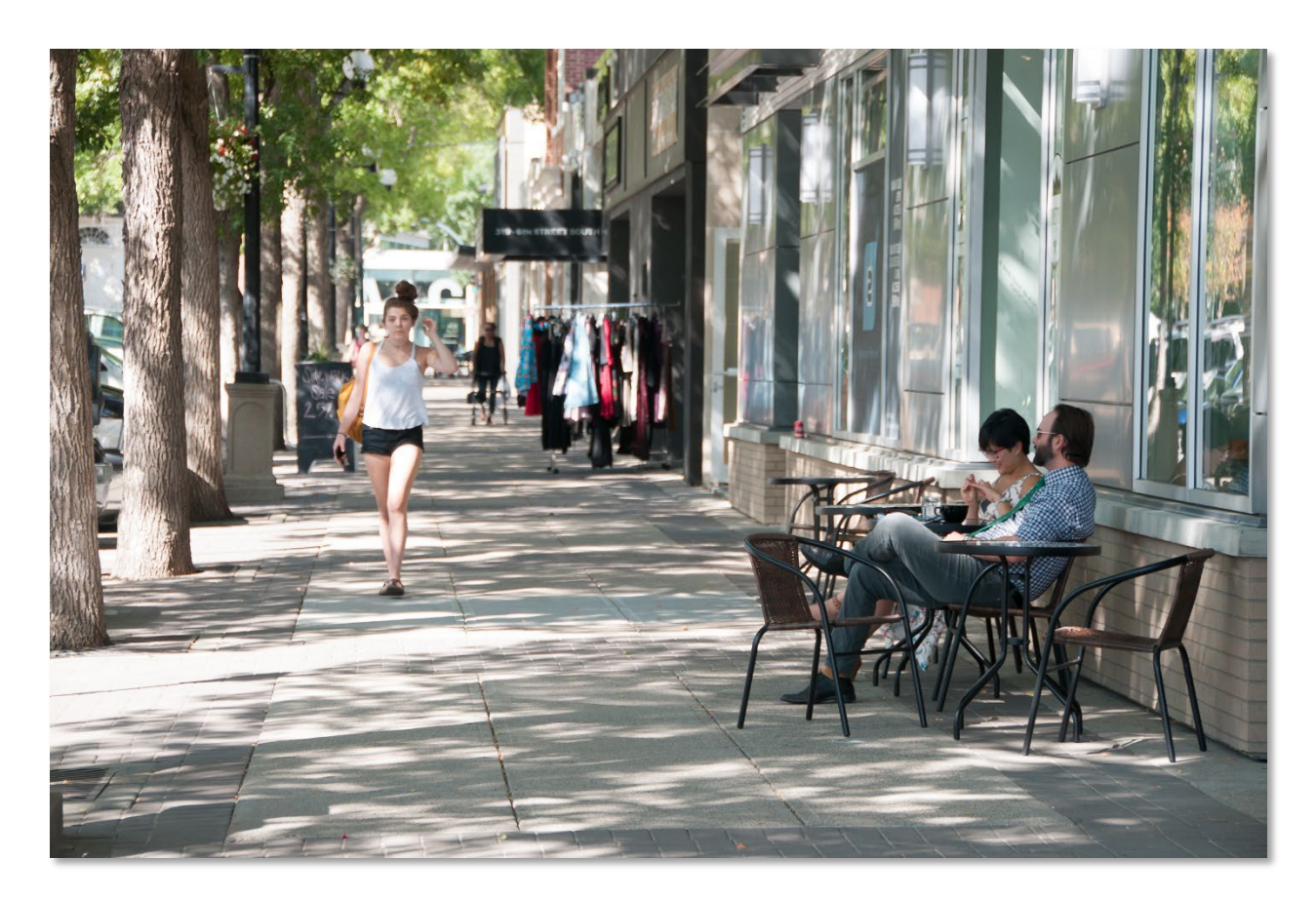
6th Street during the summer months in Downtown Lethbridge

The City and BIAs share a commitment to build a vibrant economy. Various departments within the City come together to support BIAs in advancing economic development and meeting their operating requirements – the main point of contact is the Opportunity Lethbridge department.