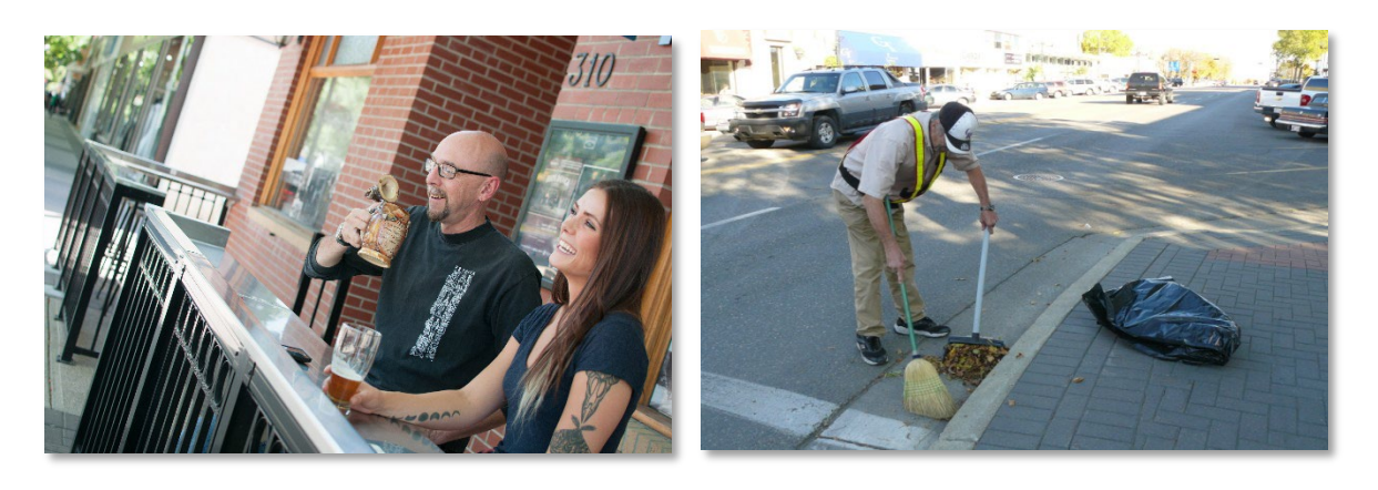
Patrons enjoying an outdoor patio in Festival Square