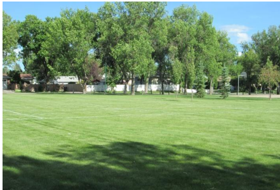
An open space bordered by trees. 2013

This neighborhood park is situated at 16 Street and 13 Avenue North on 1.63 acres. It is a small mature park easily accessible and with plenty of street parking.