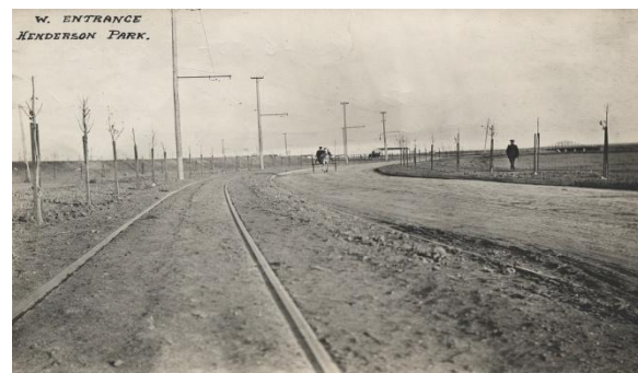
Streetcar tracks Henderson Park 1912 19640657000