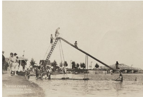
Water slide and swim area 1930 19730064000

Also marching bands frequented the park during the summer. In the 1950s and early 1960s the Lethbridge Junior Band marched from their practise hall on 12 Street and 7 th Avenue to Henderson and using the bandstand gave an impromptu concert for park goers. In the late 1960s the Lethbridge Kiwanis Band did the same but by then the bandstand was gone and they stood in the area where the entrance to Japanese Gardens is today.