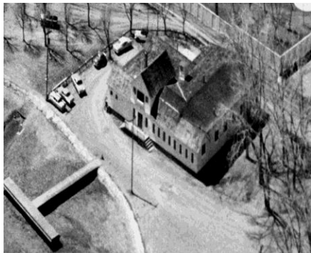
Aerial of the Dance Pavilion 1977

From the dock pavilion located at the centre of the north side of the lake a dock made of heavy plastic juts out into the lake. This replaces the wooden dock once located at the west end where the dance pavilion stood. There are several structures adjacent to Henderson Lake. These are: Henderson Ballpark [now Spitz Stadium ] as of 2010. The Henderson Lake Golf Course. The course had grown from the Athletic Association's desire to start a golf course there in 1913. The Henderson Lake Campground was until