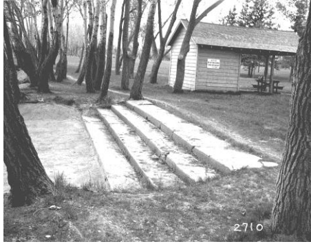
Steps down to the water. 1950s 199710803168

At the northeast shoreline of the park visitors notice cement steps leading into the water. These old steps were the Rotary Club's first project and assisted the swimmers. Occasionally called the old steps Rotary Beach.- opened in 1926. They were also used by fisherman. A gazebo and dressing rooms were built just north of the steps. They led to the swimming area.