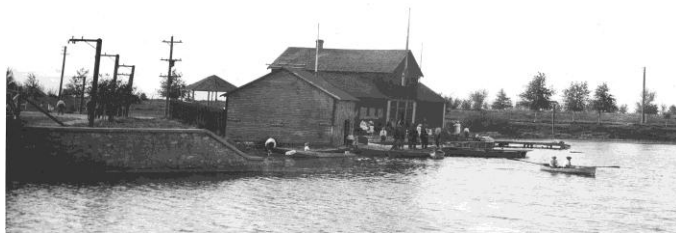
The bandstand is behind the teahouse 1912 19640532000

Also marching bands frequented the park during the summer. In the 1950s and early 1960s the Lethbridge Junior Band marched from their practise hall on 12 Street and 7 th Avenue to Henderson and using the bandstand gave an impromptu concert for park goers. In the late 1960s the Lethbridge Kiwanis Band did the same but by then the bandstand was gone and they stood in the area where the entrance to Japanese Gardens is today.