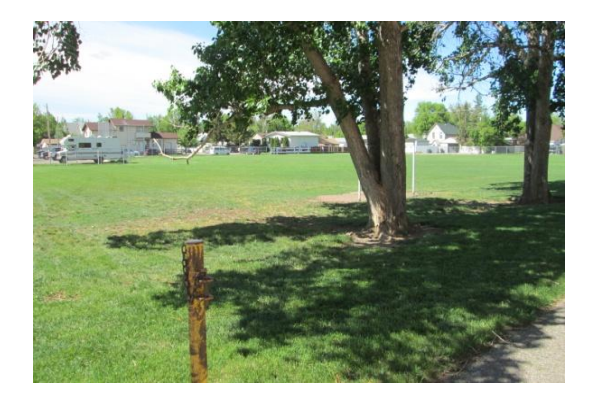
The Westminster School Community Play area open space, 2013.

The Westminister School Community Play Area is to the south of the playground. It is an open space adjoining baseball diamonds and sports field. There are tennis courts for for the public's use on the north side of the school.