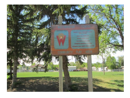
The Westminster School Community Play area sign, 2013.

Enhancement Project in 1990 when new equipment was purchased and the playground was updated.