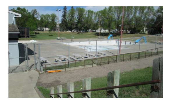
The outdoor pool at the Community Centre, 2013.