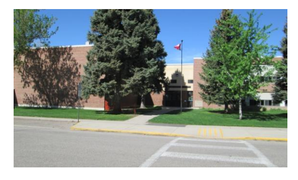
Westminster School built ca 1967 on 18 Street North; 2013.

This north side park occupies 3.59 acres bordered by 16<sup>th</sup> and 18<sup>th</sup> Streets and 3A and 5<sup>th</sup> Avenues North, and was developed in 1949. It is home to the Westminster School, Pool and Community Centre. The school is located on the south end of the area on 18<sup>th</sup> Street. This is the new Westminister School, not to be confused with the first Westminster School (1905-1968), built on 13<sup>th</sup> Street and 5<sup>th</sup> Avenue North.