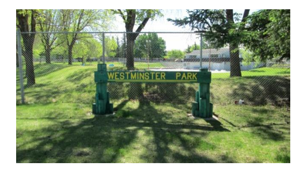
Westminster Park sign, 2013.